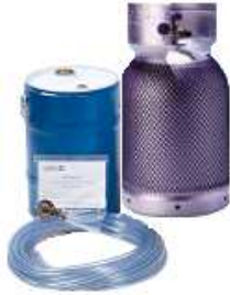
Non contractual photo