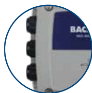
MULTIPLE CABLE GLANDS