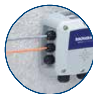
EASY TO WIRE