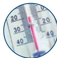
LOW TEMPERATURE PERFORMANCE