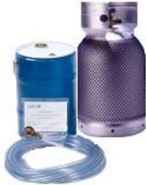
Non contractual photo